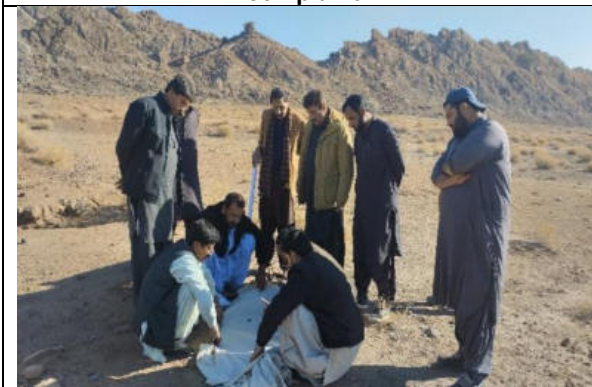
Land Ownership survey of CAD Component