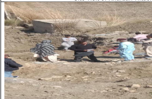
Site visit of Kharzan-Hitachi area to resolve a complaint