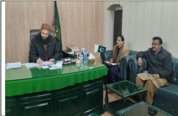
Resident Engr. and Resettlement Specialist hold a meeting with DC Zhob regarding land compensation to the DPs.