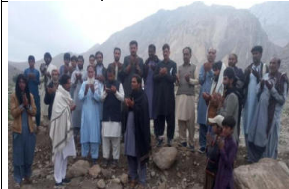
Site visit of Kharzan-Hitachi area to resolve a complaint