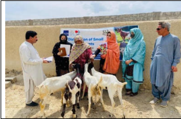
Provision of goats to the selected poorer women