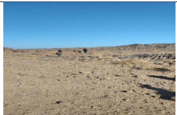
Survey Team conducting land survey of CAD