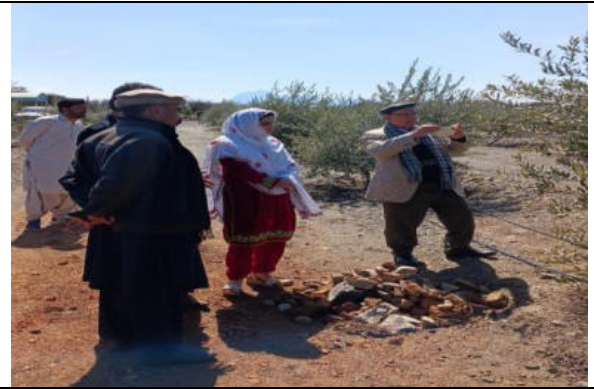
Visit of External Monitor of ZRB area