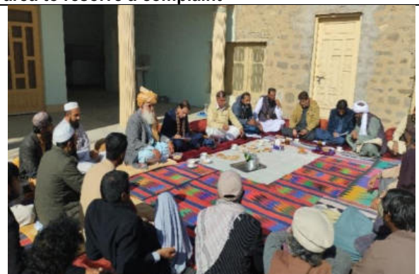
Meeting with local community on CAD Works