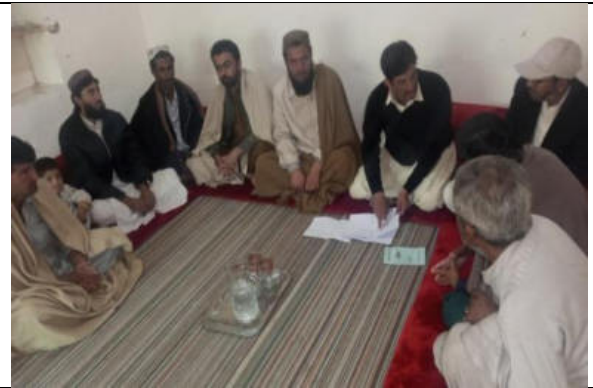
Meeting with Locals on CAD Component.