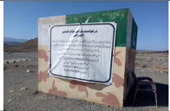
Pana Flex displayed at various locations in the Project area to receive their land compensation