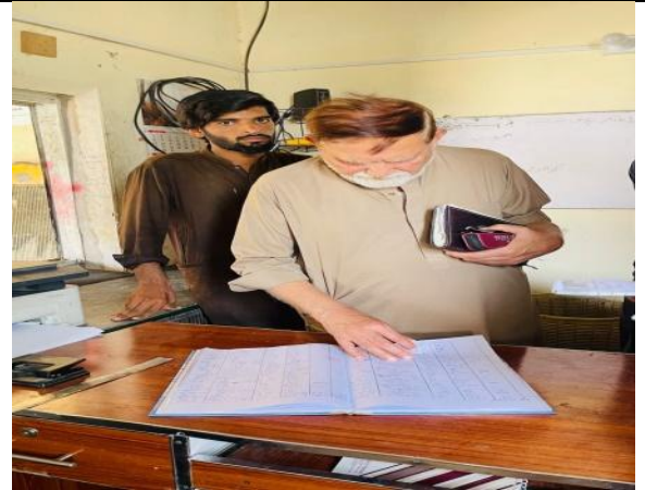
At contractor offices