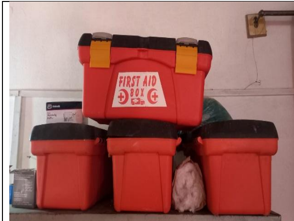
First Aid Boxes