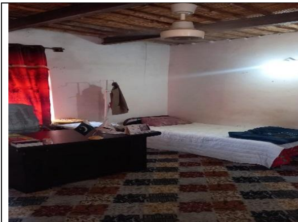
Medical emergency room at camp