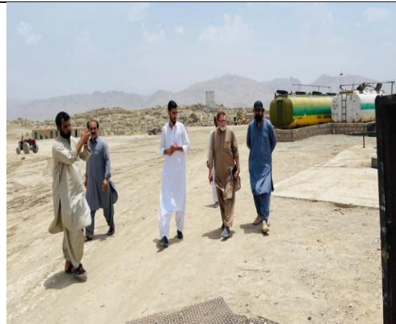
At Spillway site activities