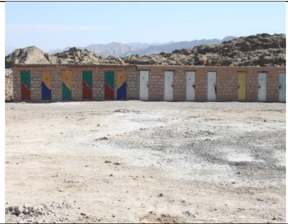
Wash rooms and Toilets for Labours