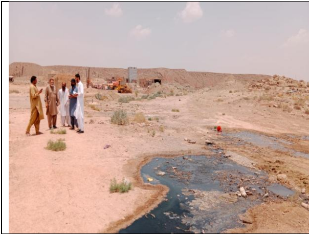
At Dam site activities