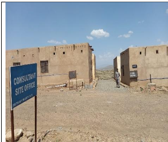
Consultants site office