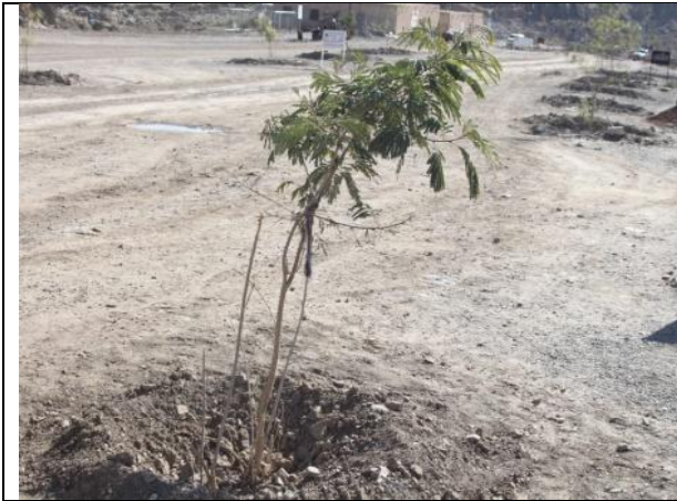
A new planted forest plant.