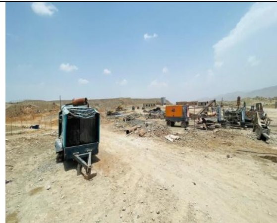
Access road to camp office