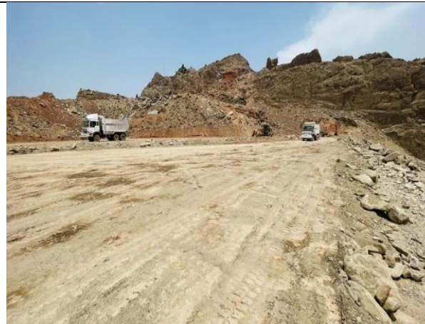
At Dam site activities