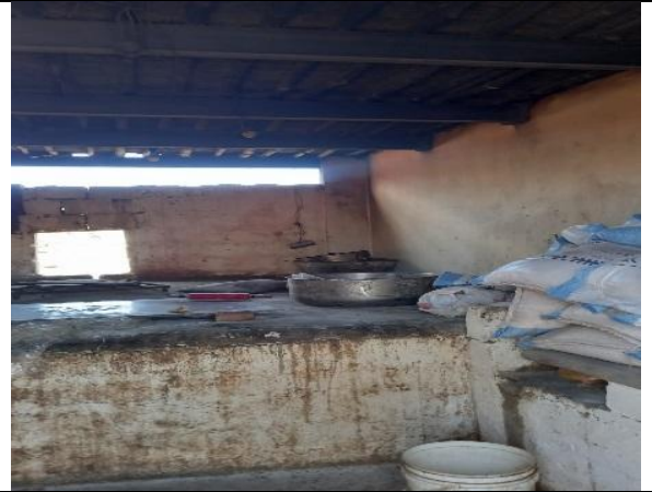
Kitchen for Labour