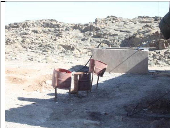
Wast Bins at labour camp