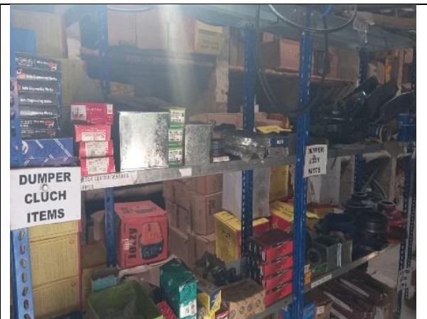
Store at site