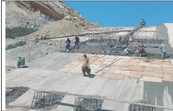
Workers without PPEs