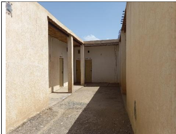
Client site office