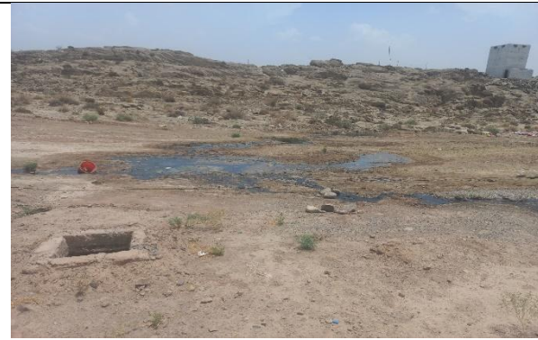
Stagnant Water at site