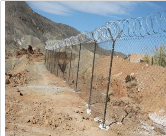
Boundary camp office protection