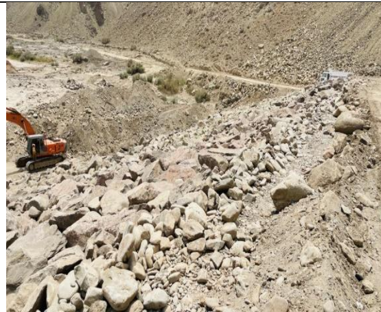
At Dam site activities