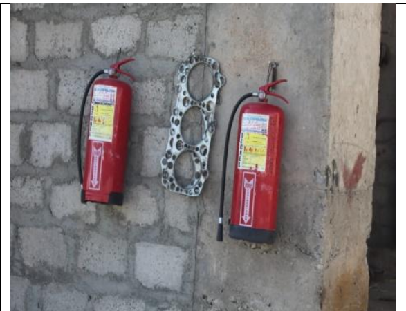
Fire extngshers at labour camp