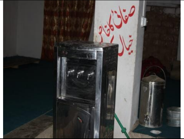
Water cooler for offices