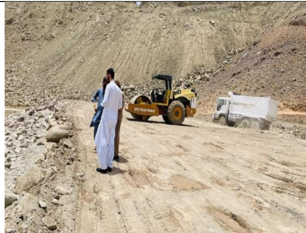
At Spillway site activities