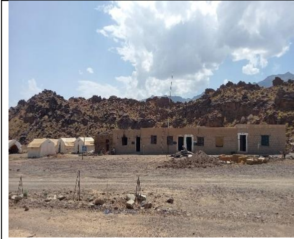
Frontier Constabulary camp