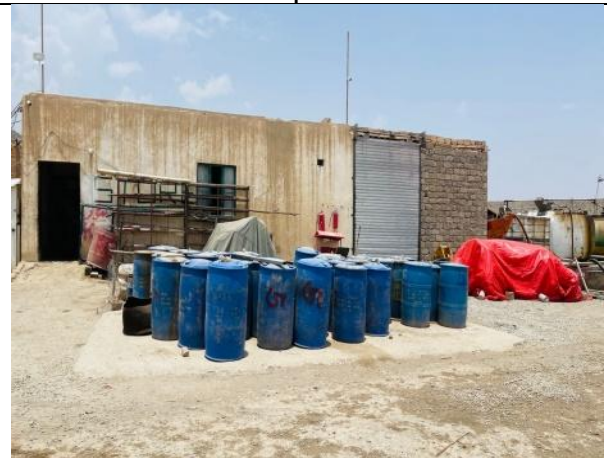
Drums for oil at camp