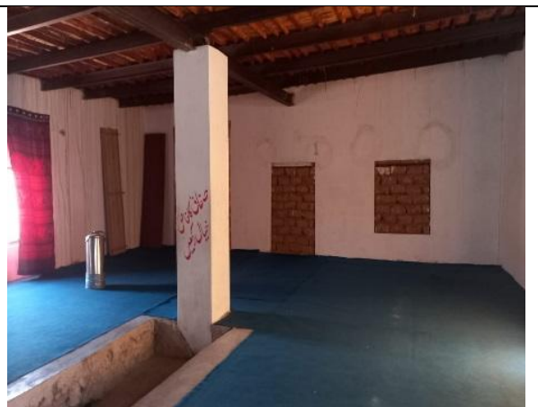
Dining room for labour