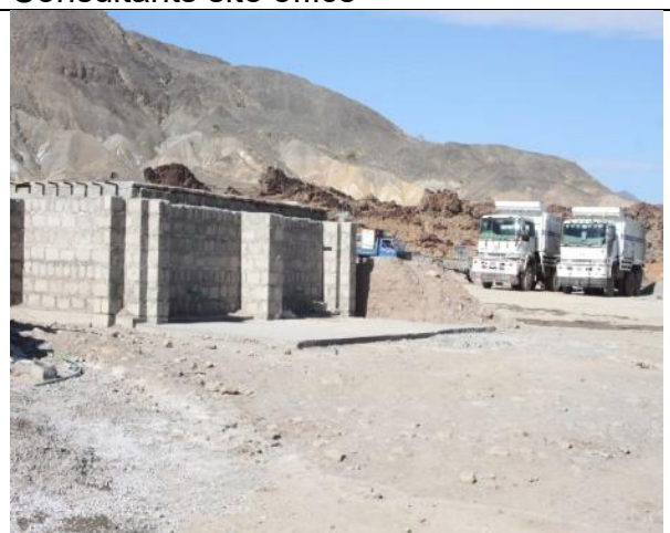
At Camp site additional rooms construction