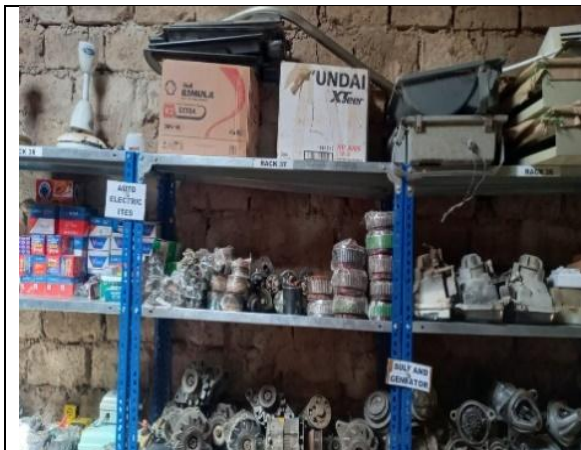
Store at site