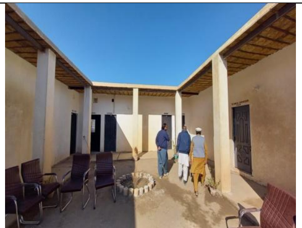
Consultants site office