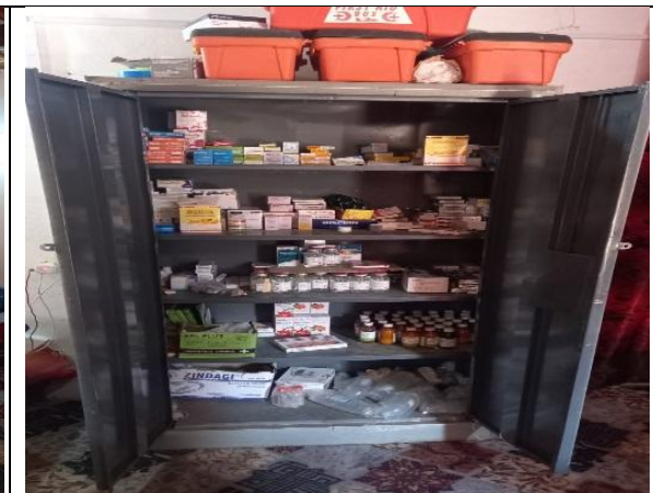
Medicine Almarah at camp