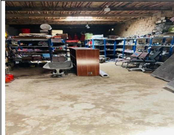
Store at site camp