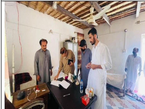
HSE Office record checking