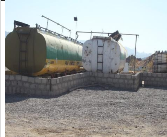
Diesel Storage at camp