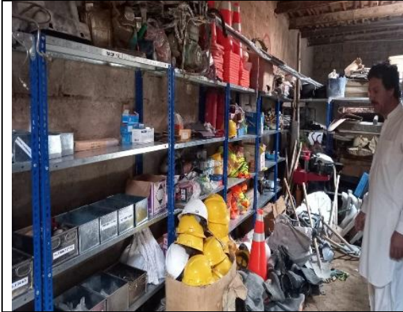
Store at site