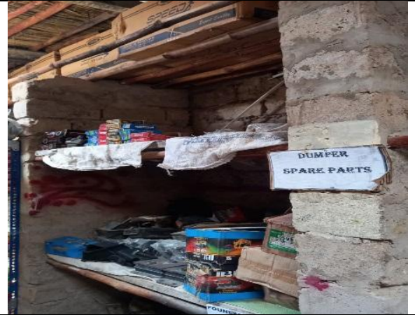
Store at site camp