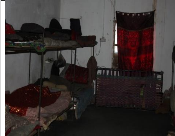
Labour room at the camp