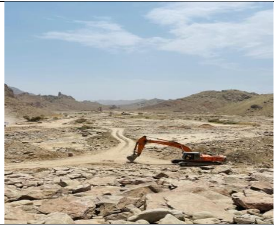
At Dam site activities