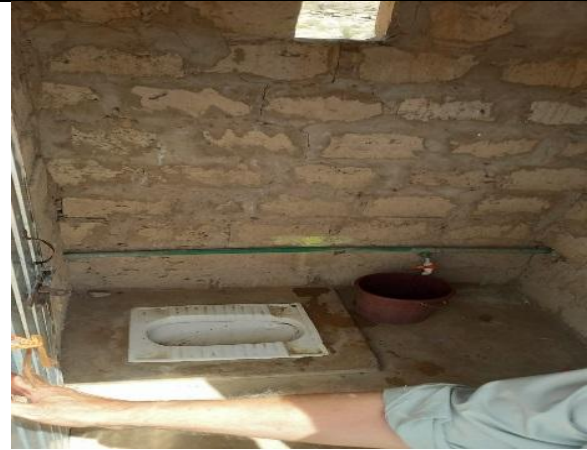
Toilet at labour camp