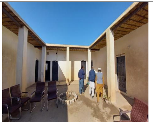
Consultants site office