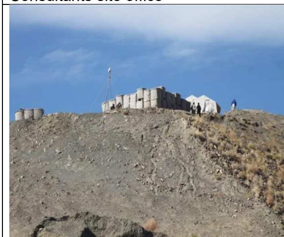
At top watching post