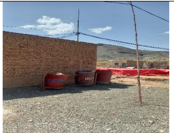
Solid Waste bins