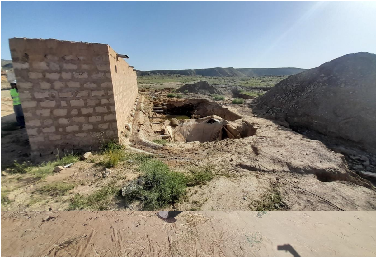
Open pit behind toilets