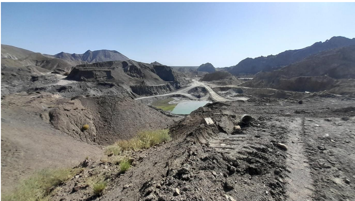
A view of Project Area