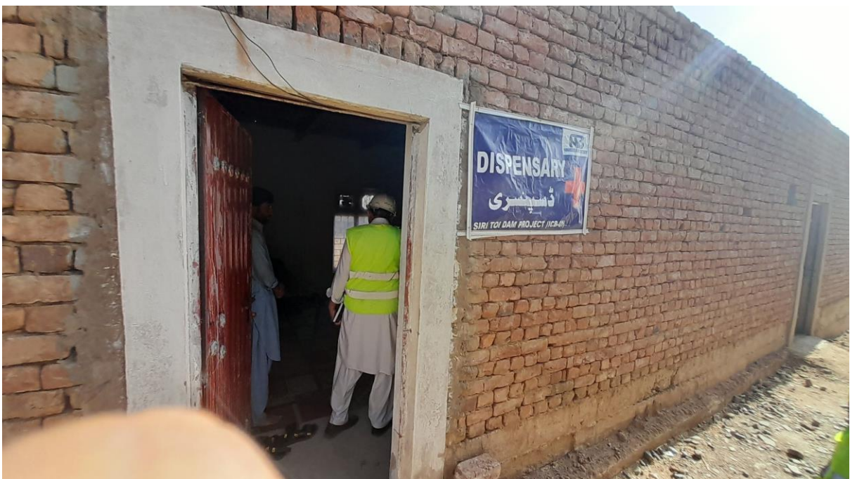
Dispensary set-up within the camp