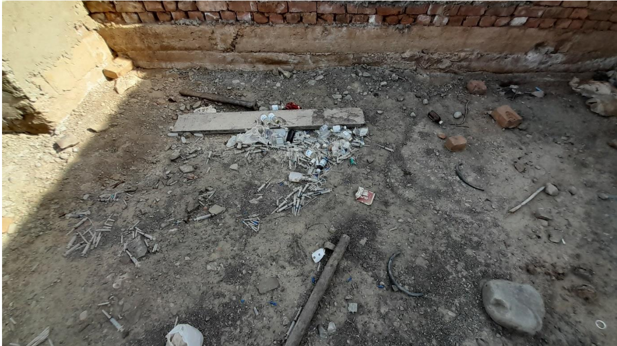
Medical Waste behind dispensary