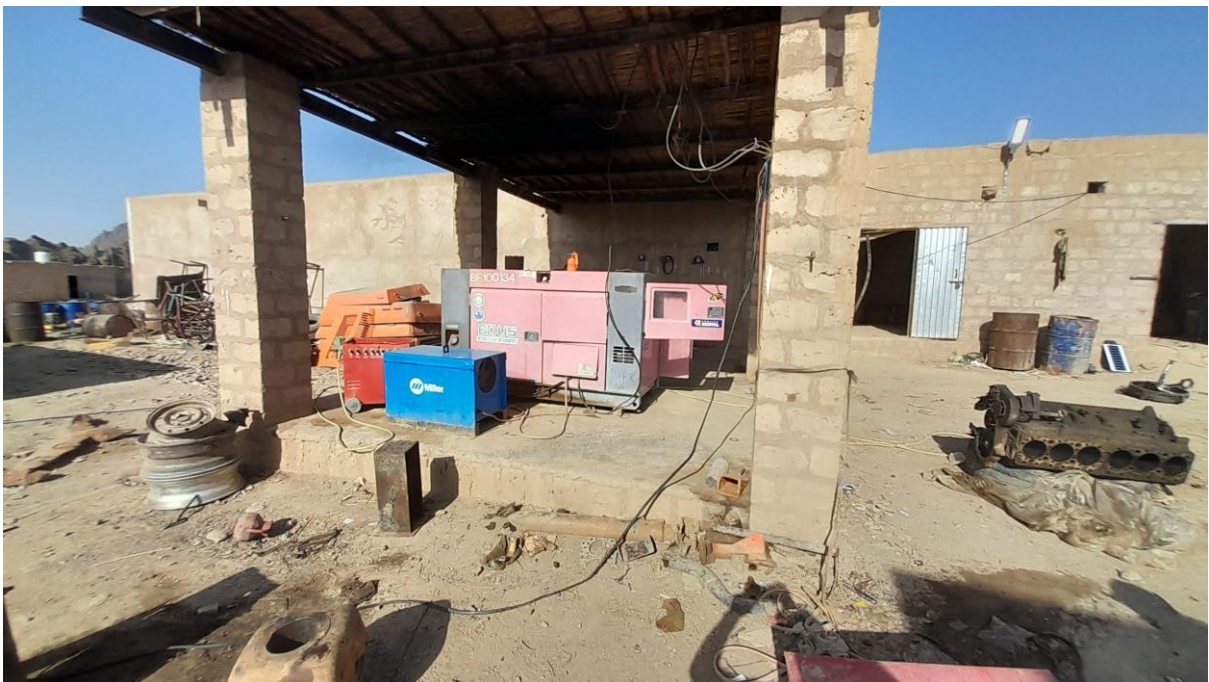
Generator setup without barricading