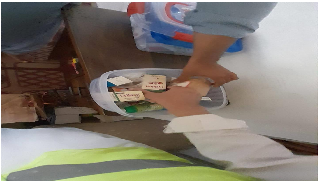
First-Aid Kit in the dispensary