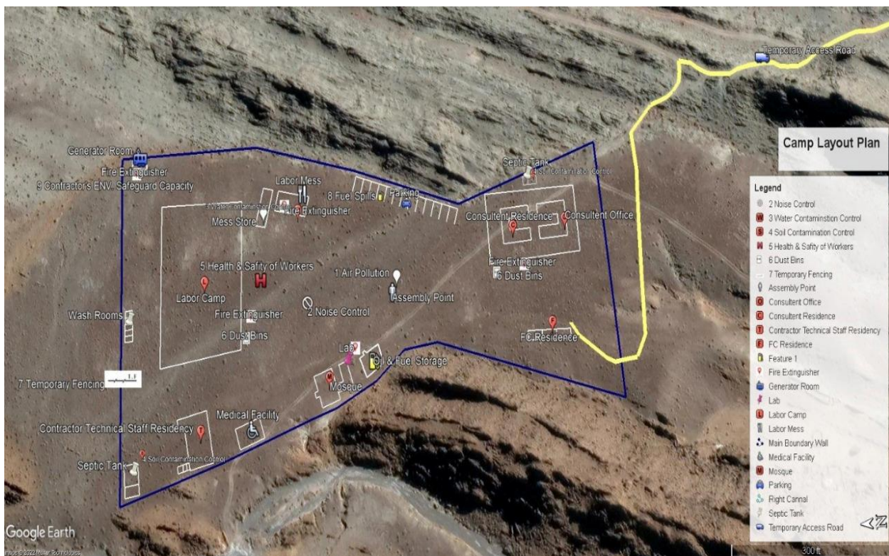
Figure 3-1 Camp Site Location