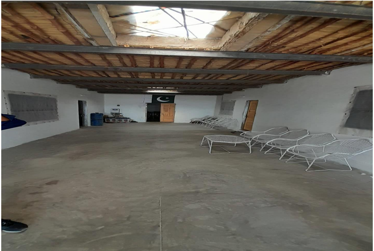
Staff Residential Area