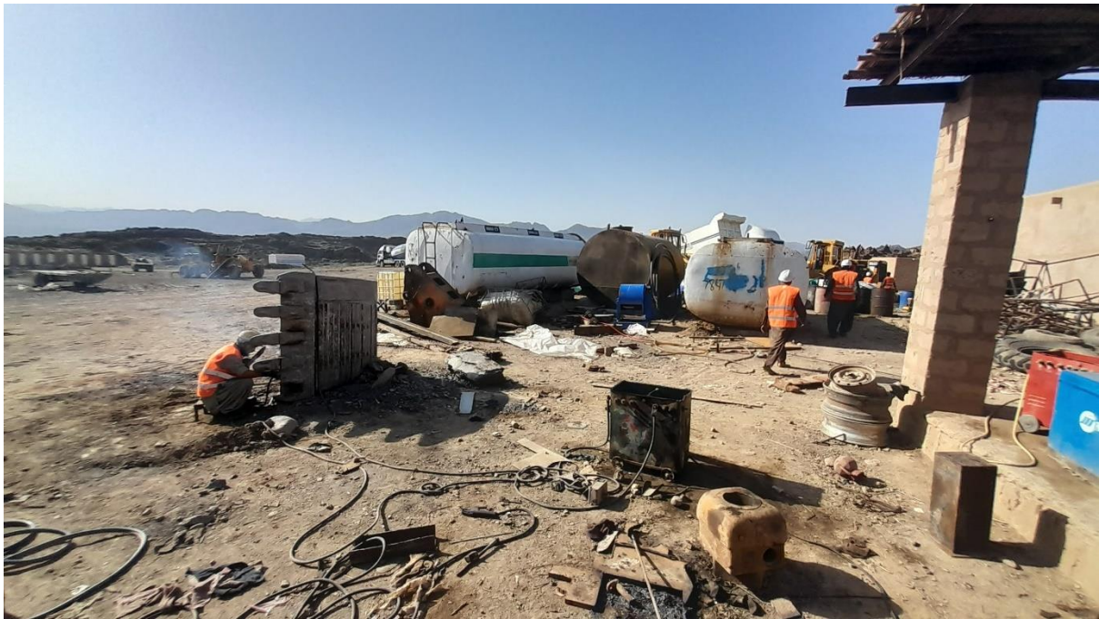
Hot work in progress