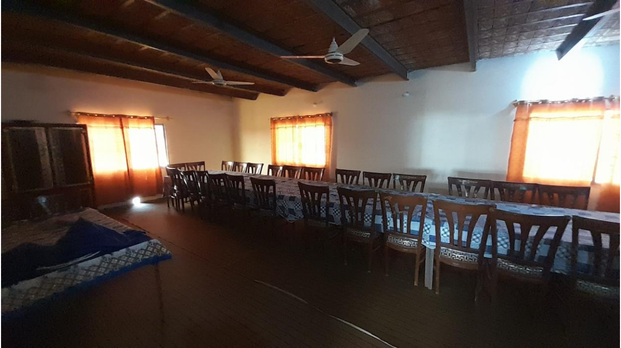
Dining Room at Camp Site