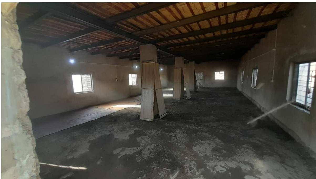
Mosque for the laborers