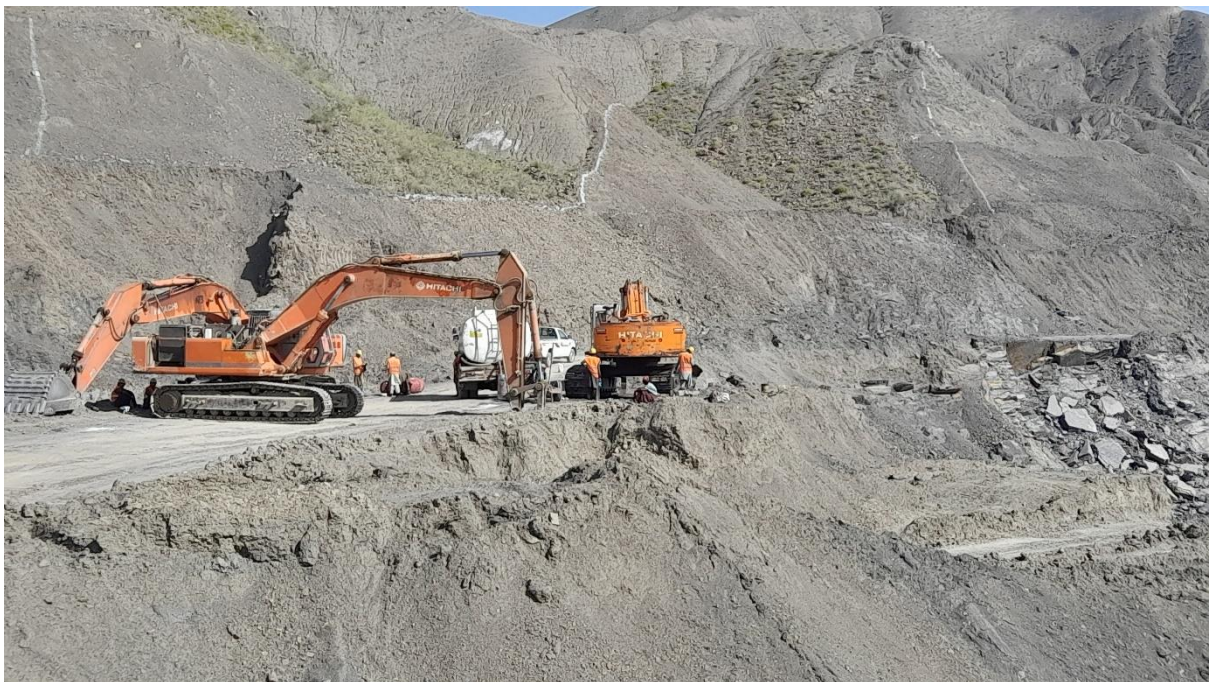
Construction Activities at Project Area