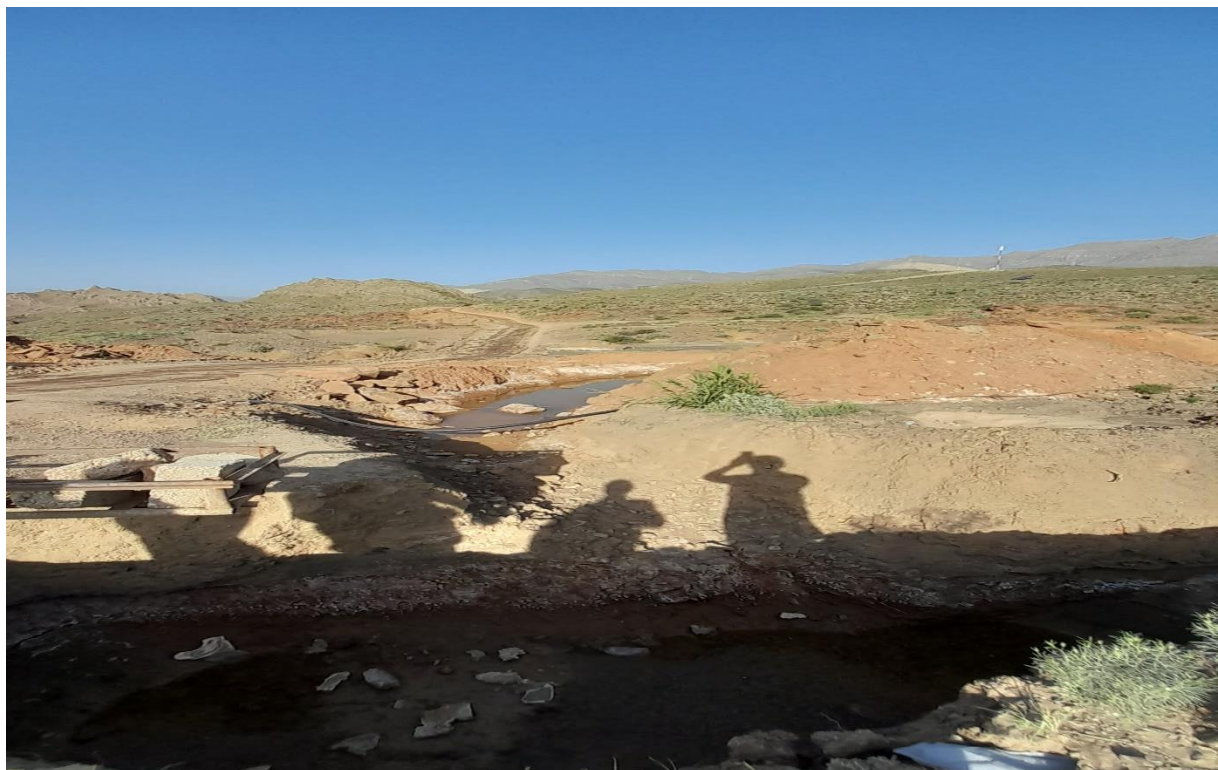
Open drainage of water in the camp area