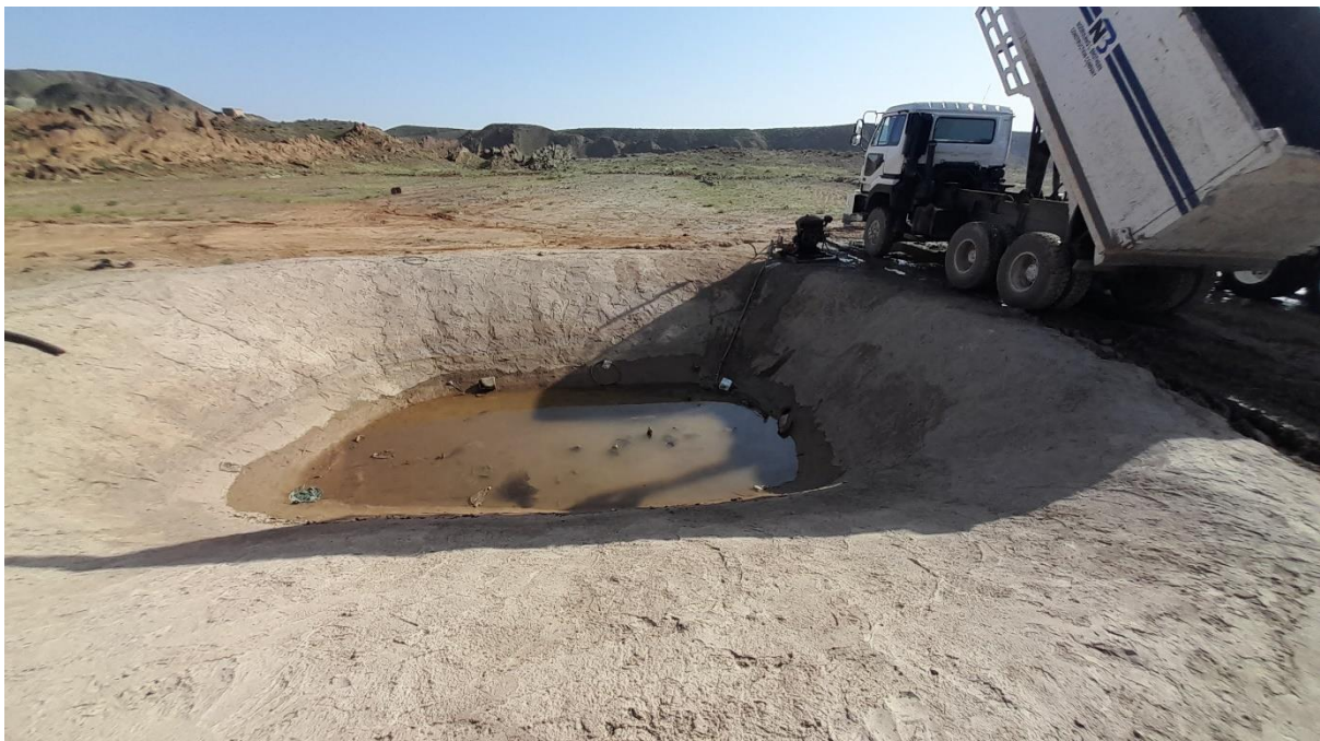
Vehicles Washing Area