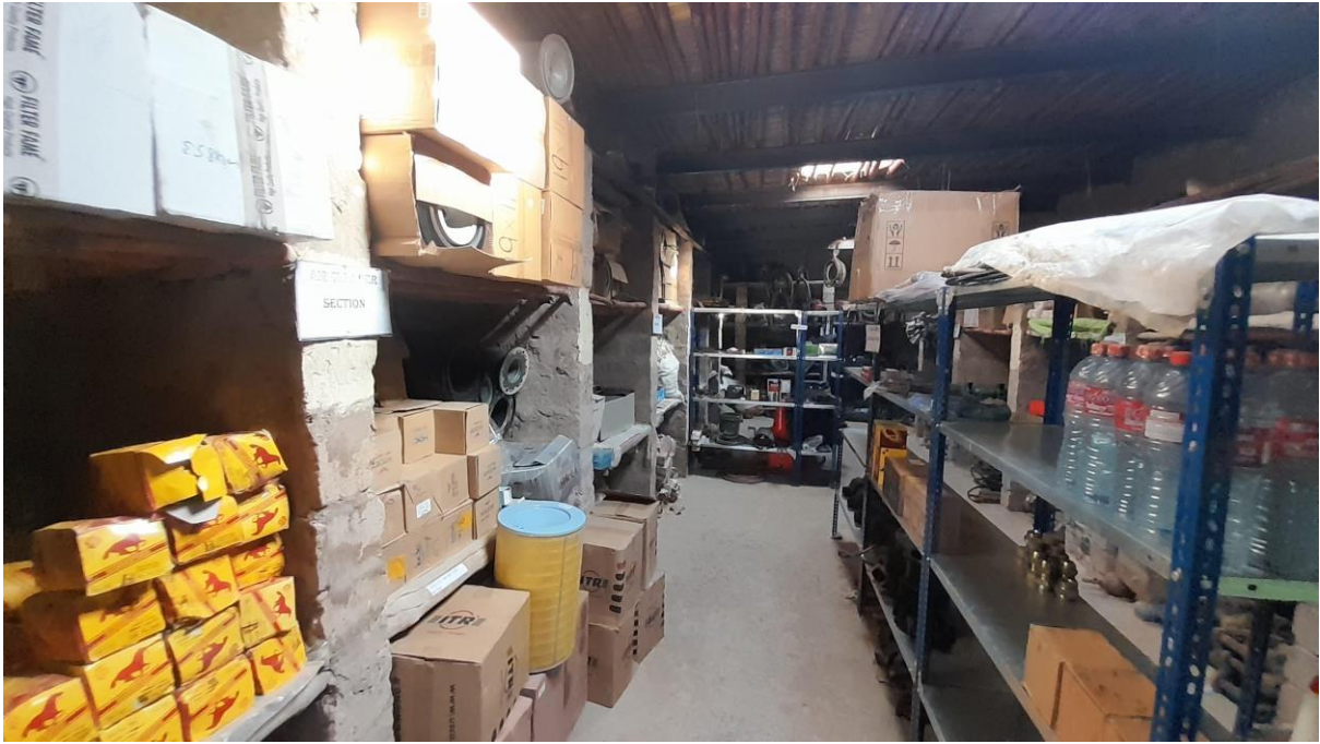
Store Room near Camp Area