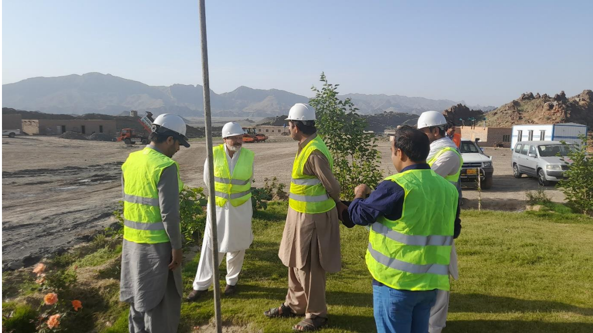
Contractors Safety Staff with Environmental Monitor