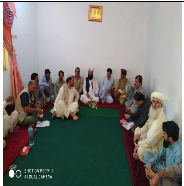
Participants of Killi Ahmad Khel (Killi Hazrat Sahib )