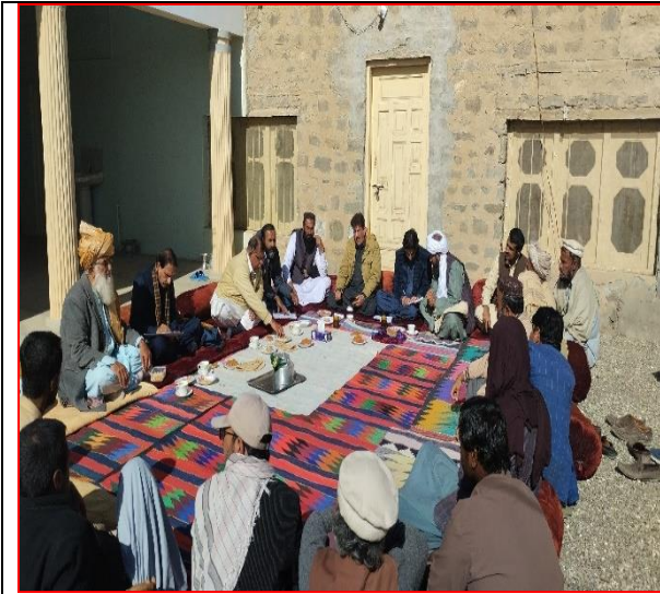
Meeting with the Community of Killi Hazrat Sahib(Jan.24)