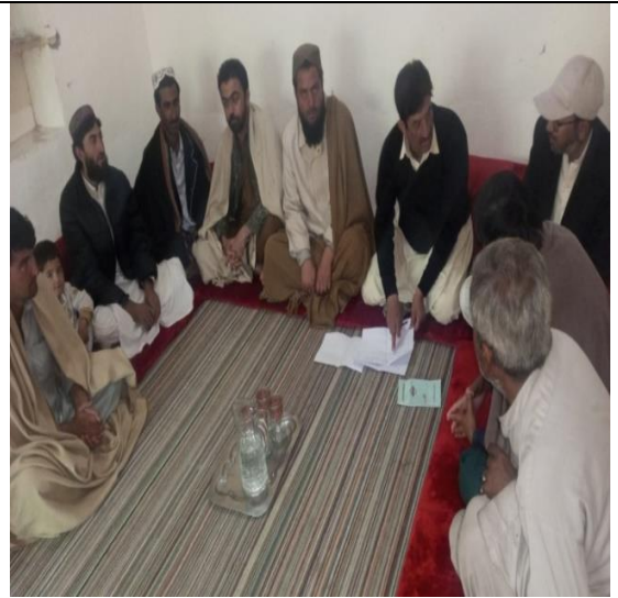
Meeting with the Community of Killi Landi (Jan.24)

INTERNAL. This information is accessible to ADB Management and staff. It may be shared outside ADB with appropriate permission.