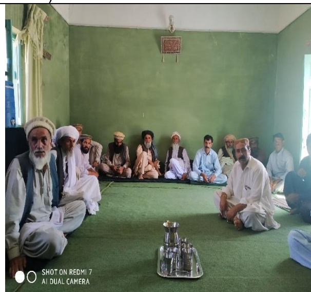
Participants of Killi Gadai Khel

INTERNAL. This information is accessible to ADB Management and staff. It may be shared outside ADB with appropriate permission.