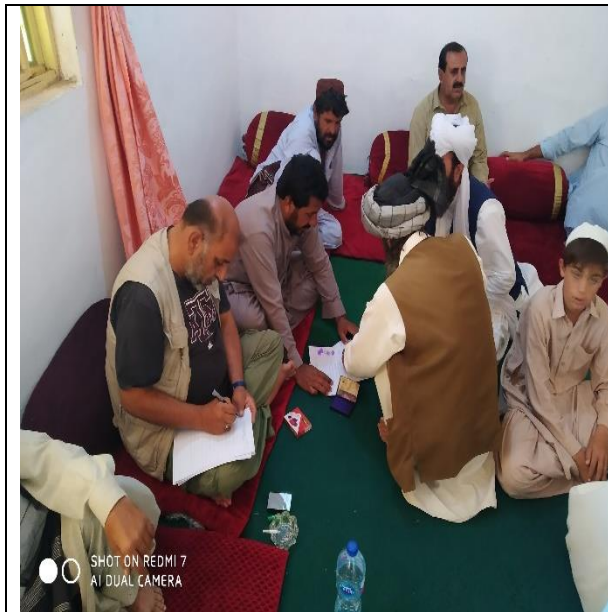
Participants of Killi Landi of Siri Toi Dam Project Area