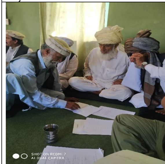
Participants of Killi Gadai Khel